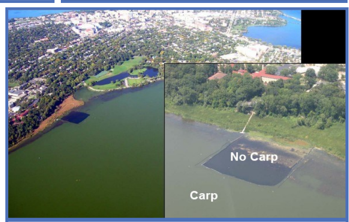
Carp exclusion curtain on Lake Wingra, WI shows potential water quality improvement when carp are controlled.

Carp are not the only cause of poor water quality, but are a significant contributor.