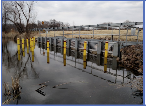
Site 3: Martin Lake north inlet

Ten sets of horizontal, removable screens. Diversion posts keep debris and floating bogs away from the structure.